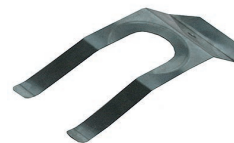
15x1/2" Neptun IWS Fitting Fastener

This fastener fixes the pipe with a fitting behind the suspended ceiling, thereby not allowing it to fall out. Recommended for liner length not exceeding 600mm. Available for 15A pipes nomenclature only.